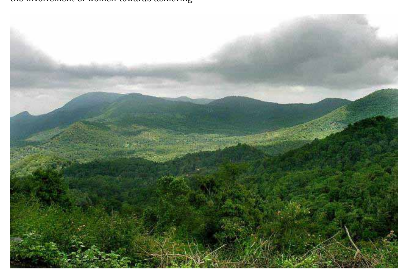
Fig.15.3.10: Western Ghats, Tamil Nadu

With a view to achieve the above objectives and to undertake the above activities, the outlay for implementation of WGDP during the Twelfth Five-Year Plan period is proposed at ₹113.85 crore with annual projection of ₹22.77 crore per year.