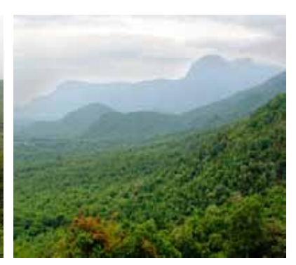
Fig.15.3.11: Eastern Ghats-Tamil Nadu