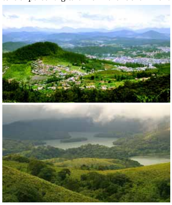
Fig.15.3.1: The Nilgiris - Queen of Hills

The Hill Area Development Programme (HADP) is in operation from the Fifth Five Year Plan (1975 – 1980) in sensitive hill areas of the Country. In Tamil Nadu, the programme commenced in the Nilgiris District with 100 percent financial assistance from the Government of India with a view to supplement the efforts of the State Government in preservation, protection and enrichment of the biodiversity of the Nilgiris District. Later, the funding pattern altered to 90 percent grant from the Government