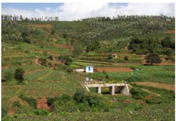
Fig.15.3.2: Provision of foot bridge in rural Ooty

Under forestry sector, afforestation in the degraded and denuded forest and their maintenance, shola afforestation and its maintenance, soil and water conservation activities inside forest areas, forest protection works, special works for wildlife management and eco tourism in forest areas, were undertaken. Under horticulture sector, promotion of coffee, spices, fruit plantations besides restoration of traditional agricultural farming practices, extension of area under economic plantations such as arecanut and coconut, medicinal plant cultivation,