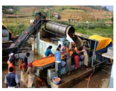
Fig.15.3.6: Post Harvest handling Unit at M-Palada