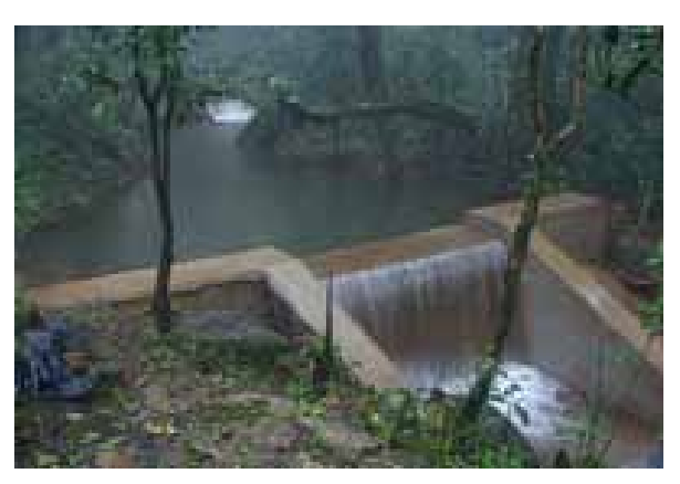
Fig. 15.3.8: Water Conservation Works Under HADP

Around 60 percent of the annual outlay under HADP is proposed to be earmarked for undertaking works in the identified priority watersheds on Integrated Watershed basis and remaining 40 percent is proposed for other than watershed works which include 15 percent for maintenance of assets created under HADP and 10 percent towards establishment costs.