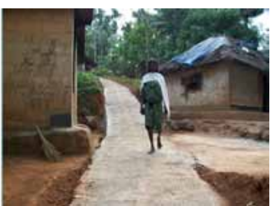
Fig.15.3.5: Basic Amenities to ST hamlets