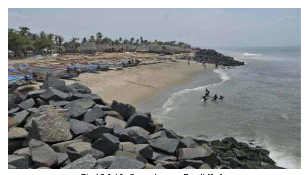
Fig.15.3.13: Coastal area - Tamil Nadu

The coastal area in Tamil Nadu is susceptible to cyclones periodically, which cause damage to life and property. The coastal area supports several important economic activities such as fisheries, ports, industries and tourism. Most ecologically critical and threatened areas in the coastal areas are coastal wet lands especially lagoons and estuaries and their mangrove swamps. The coastal areas provide food and shelter for waterfowls, fishes, crustaceans, molluscs including some of the world's lucrative