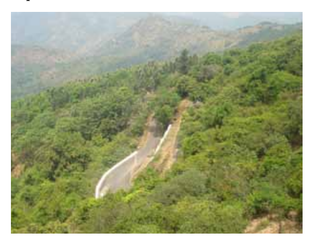
Fig.15.3.12: Eastern Ghats-Tamil Nadu

During the Tenth Five Year Plan period, an amount of ₹1.00 crore was sanctioned during 2005-06 for the implementation of Eastern Ghats Development Programme. Against this, an amount of ₹0.96 crore was spent on various activities by different departments.