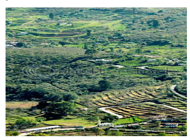
Fig.15.3.9: Terraced fields in Western Ghats Mountains in Kodaikanal, Tamil Nadu

The Western Ghats region in Tamil Nadu ranges from Gudalur Taluk in the Nilgirs district and ends up at Agastheeswaran Taluk in Kanniyakumari district. Since the Nilgiris district is covered under Hill Area Development Programme, it is excluded for the implementation of WGDP. Western Ghats region, therefore, falls in 33 taluks of eight districts, - Coimbatore, Tirupur, Dindigul, Theni, Madurai, Virudhunagar, Tirunelveli and Kanniyakumari. The total area covered under WGDP is 26,000 sq.km. which is 20 percent of the total area of Tamil Nadu.