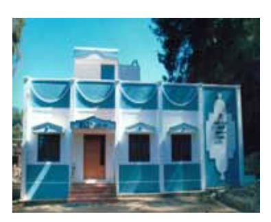
Fig.15.3.7: Construction of farmers training centre in Ooty